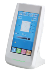
可选配Option 触摸屏 Touch screen