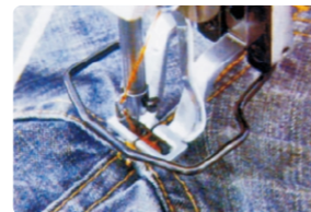
牛仔加固 Cowboy reinforcement