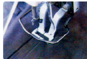
兜脚加固 Drop foot reinforced

The computer direct drive mode is adopted. The starting/stopping response is fast and the rigidity of the frame is high. The low vibration and noise are realized. Servo-controlled feeding device and needle rod take-up rod device with optimal synchronization and stroke are equipped to realize low tension of sewing. The trouble of sewing material being polluted is eliminated by adopting non-oil supply technology. It can be used for menswear/women's wear, jeans, knitted fabrics and underwear.